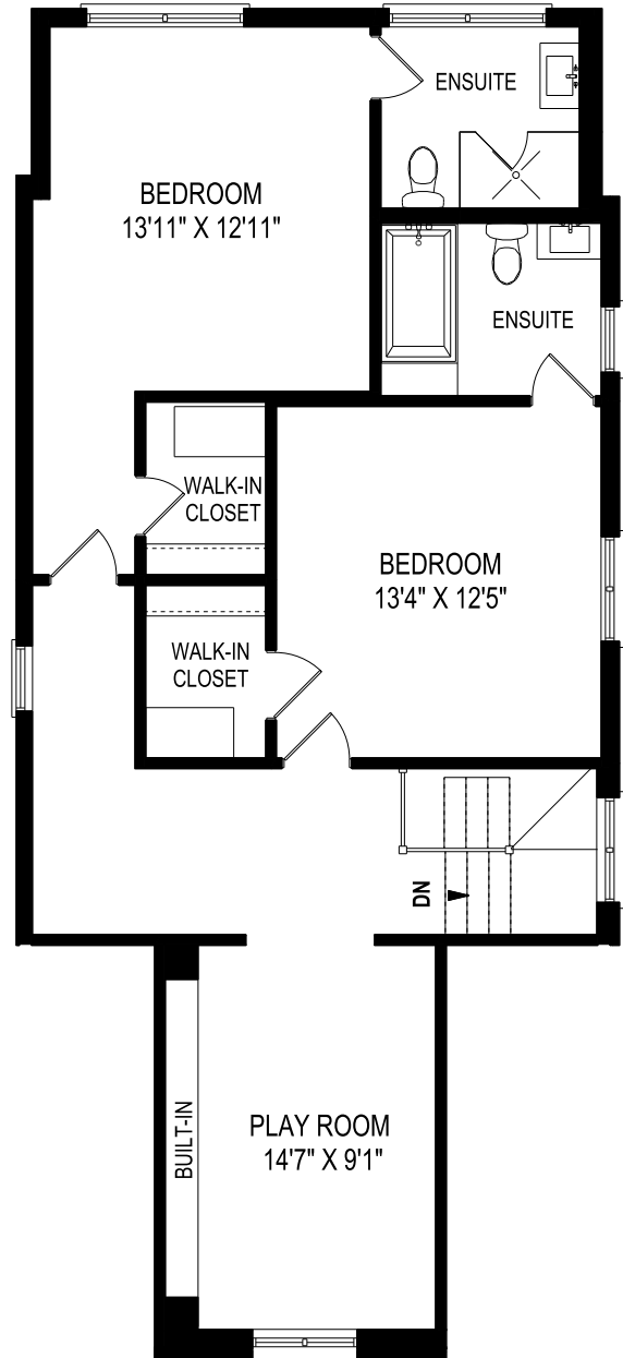
THIRD FLOOR 994 SQUARE FEET CEILING HEIGHT 8'3"