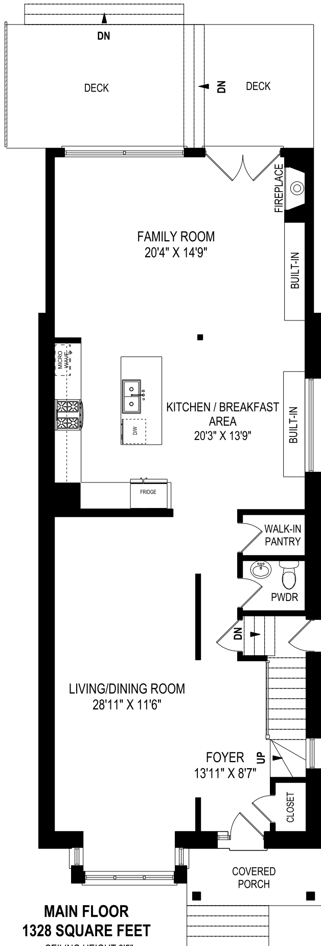
MAIN FLOOR 1328 SQUARE FEET CEILING HEIGHT 8'5"